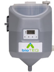
enduroTEQ Nexa-DT Dispenser